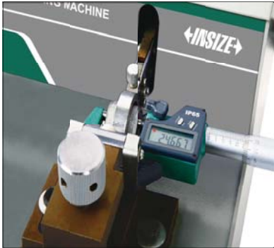
lapping measuring surfaces of outside micrometer