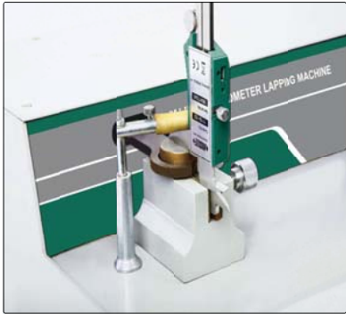
lapping measuring surfaces of caliper lower jaws